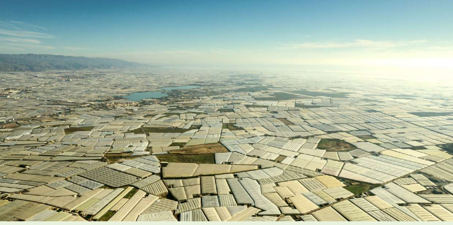
The bleakly named "Plastic Sea" of Almería.