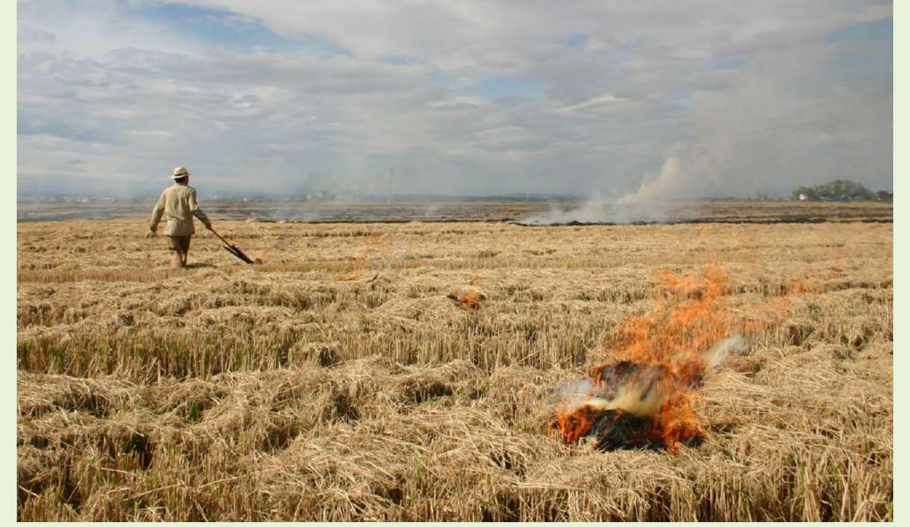
Burning of the stubble continues in the rice fields of Albufera despite being inadvisable.