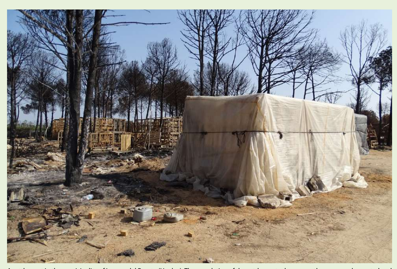
A settlement in the municipality of Lucena del Puerto (Huelva). The population of the settlements changes as the crops are harvested and the workers move to other parts of Spain, such as Almería, the Region of Murcia and Lleida.

The provinces of Huelva and Almería occupy the unfortunate top rankings in terms of settlements of people who work in the fields and often lack the most basic of employment and human rights. In 2021, there were 41 settlements in the strawberry area of Huelva, in the municipalities of Lepe, Moguer, Palos and Lucena, with approximately 3,500 inhabitants concentrated especially during the main harvest months, March and April. In the 2022/23 crop year, 25 settlements have been counted, most of them in the Doñana area.